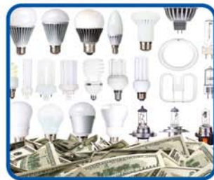
Rebates & Incentives