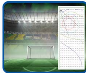
Point by Point Layout